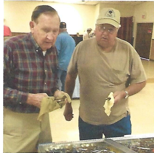
Looks like a lot of thought going into this observation!

Our next meeting will be Tuesday evening at 7:00 PM at the Greer Recreation Center.